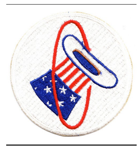
94th Sqn Patch, 'Hat in the Ring'

An outstanding effort from the engineering community saw the very same jets used on Red and then Green Flag, stage across the continent, arriving on the east coast in late March to be used on Ex TRILAT. The sense of pride taken by the team has been palpable and had a hugely positive impact on the Typhoons performance on the Ex. It hasn't gone unnoticed by the other nations that we are consistently turning up every morning to find a line full of serviceable jets. A very enviable position to be in and one that we certainly don't take for granted, it has been a dedicated and professional performance from all the support staff.